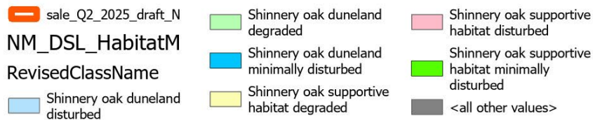
Figure 1. Overlay of May 2025 oil and gas lease boundaries (parcel NM-2025-05-6850) with Dunes Sagebrush Lizard ( Sceloporus arenicolus ) habitat based on the Species Status Assessment completed by U.S. Fish and Wildlife Service (USFWS 2023).